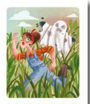
and screamed. She was still screaming as she ck to the Fermine in to pack her b