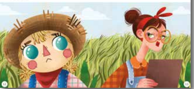
Scorlet's straw-stuffed body shook No," she thought. 'Please don't get rid of me! 1'll try harder. I'll score those trows av

WWWW/1" screamed all the crows toget ng a terrible phostly noise. They flapped gs underreath the sheet, making it