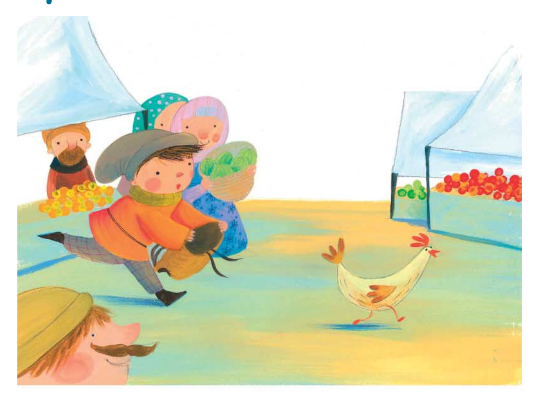
There are 3 differences to spot! Can you find them all?