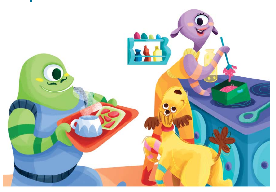
There are 3 differences to spot! Can you find them all?