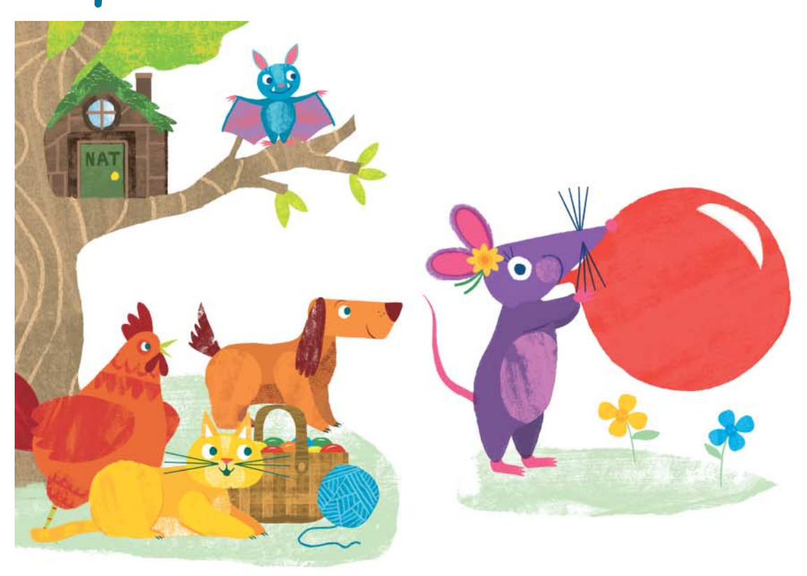
There are 3 differences to spot! Can you find them all?